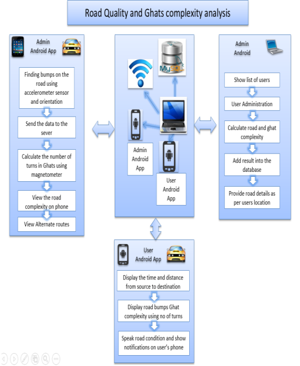
Fig.1 Conceptual image of continuous road condition monitoring system